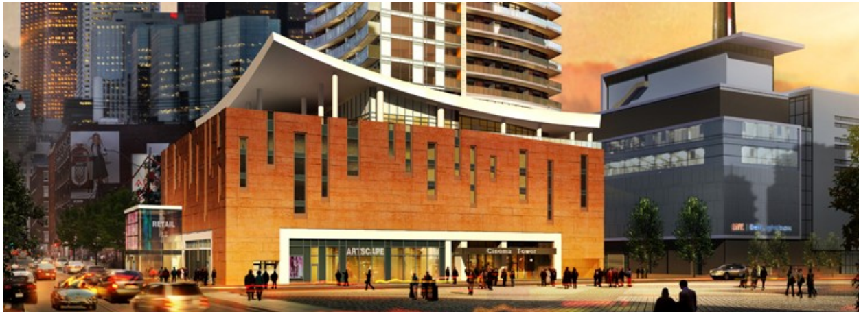
Rendering of Podium Façade

Powning's reputation in the visual arts and public art make him a logical choice as an artist who could focus on the particular challenges of developing a concept to tell a story about the history of the site through the podium façade and advance it into a workable design that can be realized.