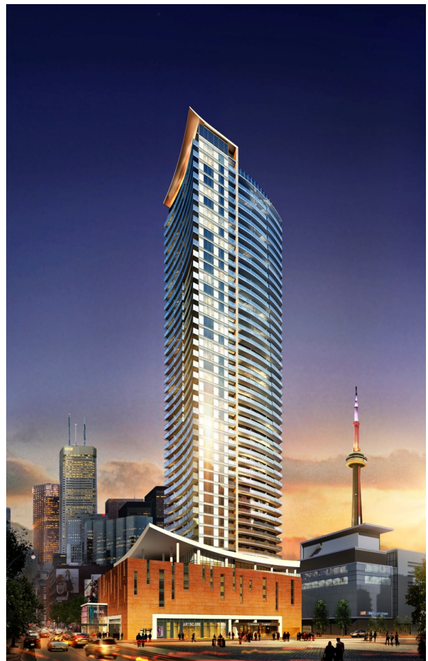
Architectural Rendering Cinema Tower

The developer is Daniels HR Corporation, the co-developer of the adjacent TIFF Bell Lightbox/Festival Tower building. TIFF Bell Lightbox, Cinema Tower and Festival Tower are central to a renaissance of the Toronto's Entertainment District, firmly establishing itself as a thriving and vibrant district for living, creating, working, and playing.