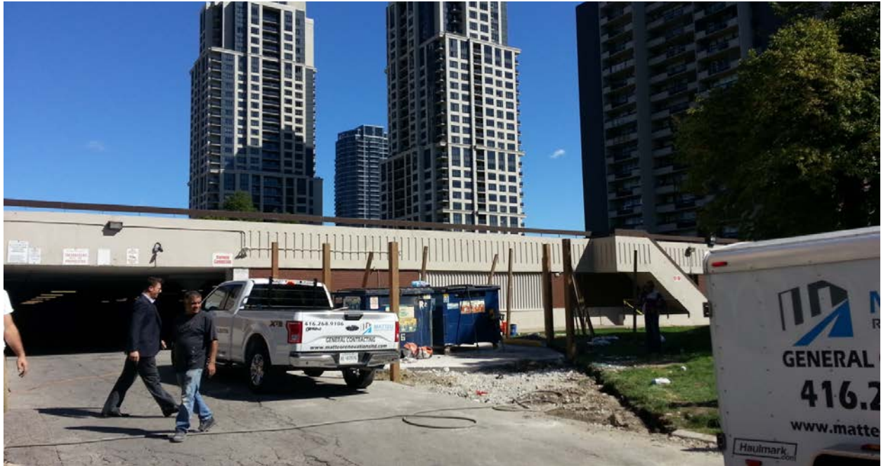
Attachment 3: Photo of the Garbage Containment Area – Front Yard