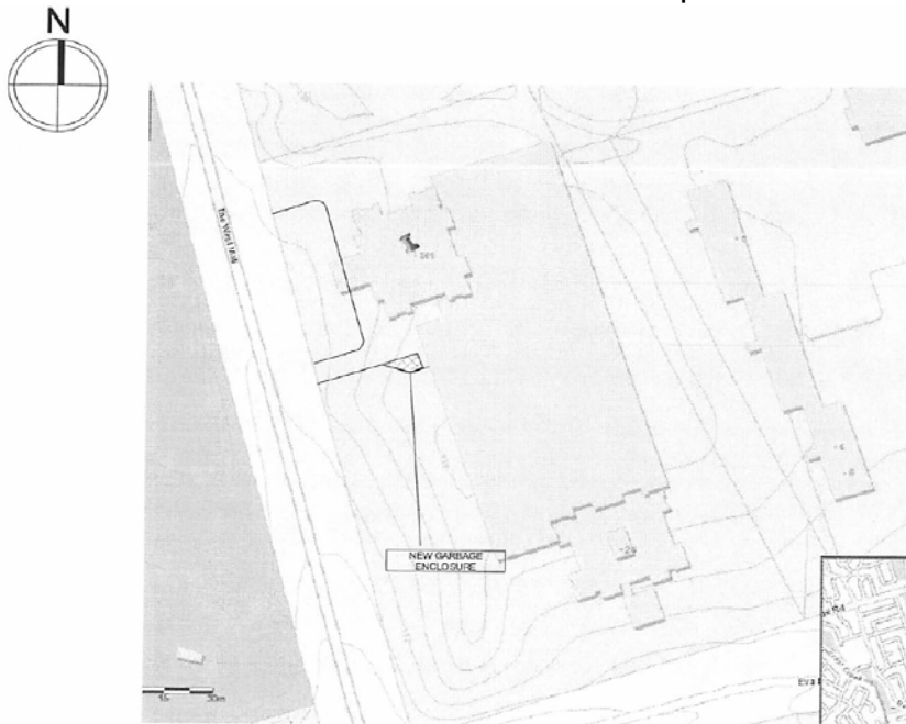
Attachment 2: Site Plan provided by Applicant