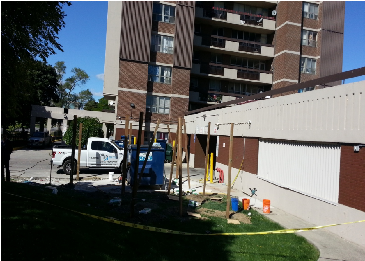
Attachment 4: Photo of the Garbage Containment Area – Showing the walkway, entrance to Underground garage and drive aisle

Staff Report for action on Fence Exemption – 361 The West Mall